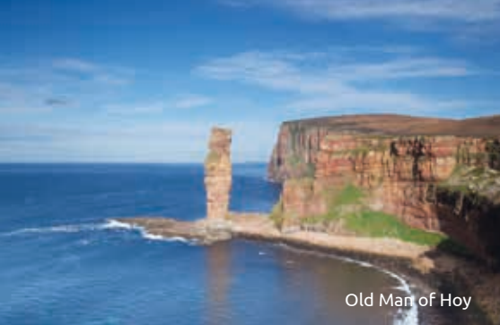
Old Man of Hoy