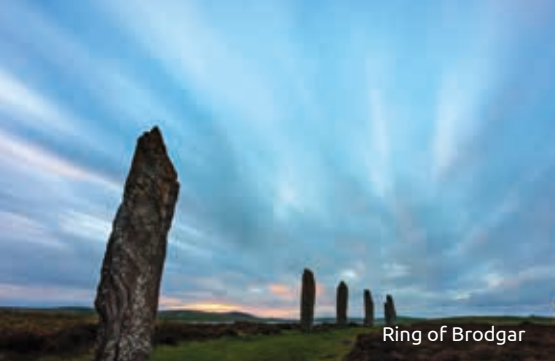
Ring of Brodgar

Brodgar is sandwiched between the lochs of Stenness and Harray. The salt water of the former is a perfect spot for watching seals , basking on the rocks just a few metres from the road. You might even catch a glimpse of an otter here too. If you are visiting in March, it's worth keeping your eye out for the last few goldeneye or long-tailed ducks too, before they begin their journey north for the breeding season.