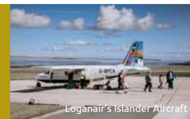
Loganair's Islander Aircraft

We strongly recommend booking your travel arrangements well in advance with Orkney Ferries and Loganair . Loganair's inter-island service uses a Britten Norman Islander aircraft with only eight seats, so capacity is limited and the flights are very popular.