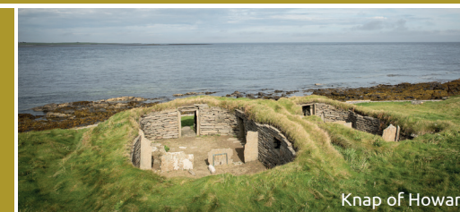
Knap of Howar

It is also advisable to book accommodation in advance. Visit orkney.com for information about the community owned hostel.