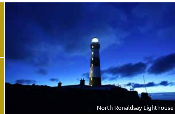
North Ronaldsay Lighthouse

North Ronaldsay is low-lying, ideal for relaxed exploration, and you'll be very conscious of the sea all round you. Whales, porpoises, dolphins and seals are regularly seen from the shore. Migrating birds draw birdwatchers from round the world. And the island's unique rare breed of seaweed-eating sheep, kept on the foreshore by a 13-mile wall round the island, are managed communally.