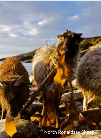
North Ronaldsay Sheep

The best way to explore North Ronaldsay is on foot or by bicycle. Bikes can be booked via the Lighthouse Visitor Centre on 07809 770082 or email bikehire@northronaldsay.co.uk .